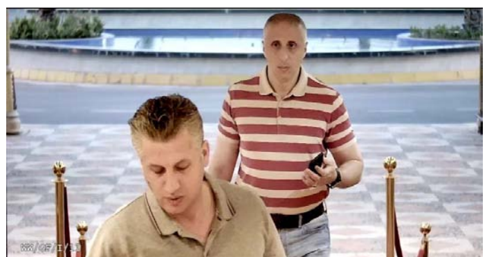
Ultra-star-light box camera