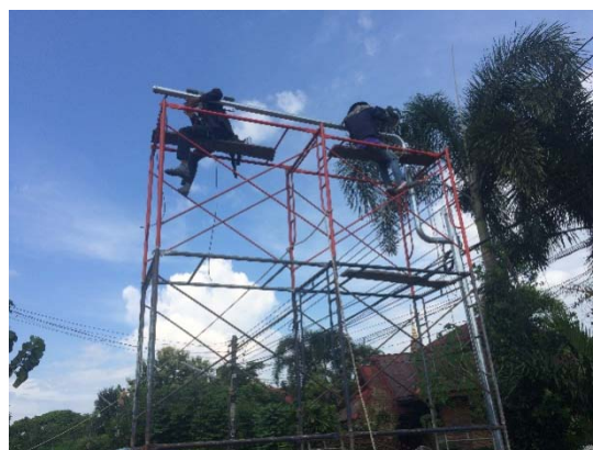
Installers setting up the cameras

Phrae, known as one of the oldest cities in Thailand, is eager to change its current traffic condition. Simply installing traffic lights to the roads is just not enough. In order to provide better driving experiences to its residents, and ideally prevent car accident from happening, a new traffic solution and upgrading to a better transportation system is the main task taken by the authority.